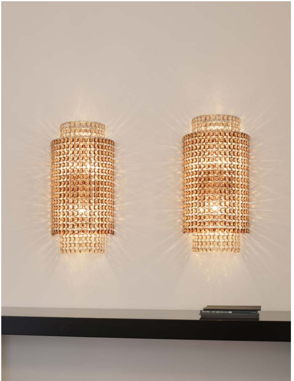
in the picture Phebo circular applique

Via Fratelli Vivarini 7, I-20141 Milano, Italy tel +39 02 895 023 42 fax +39 02 895 409 74 info@lollimemmoli.it www.lollimemmoli.it